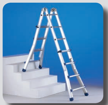
Used on stairs