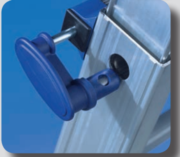
covered in nylon